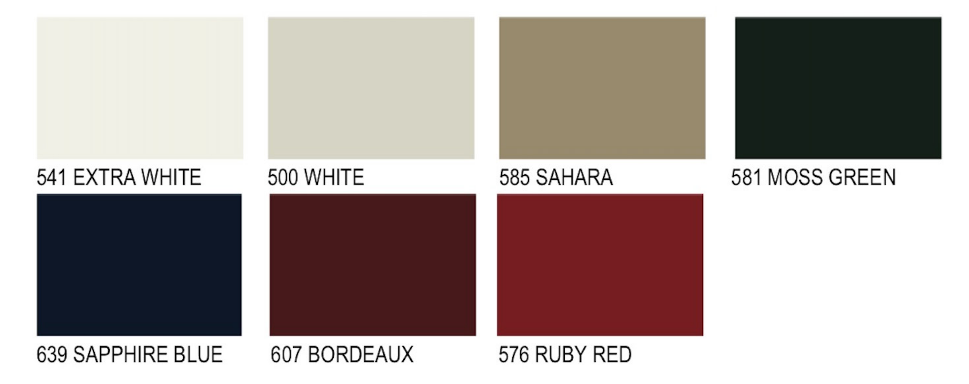
*Delivered in 12-18 Business Days