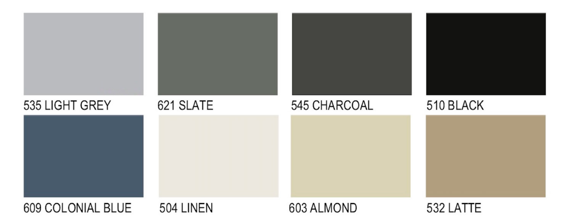
*Delivered in 3-6 Business Days